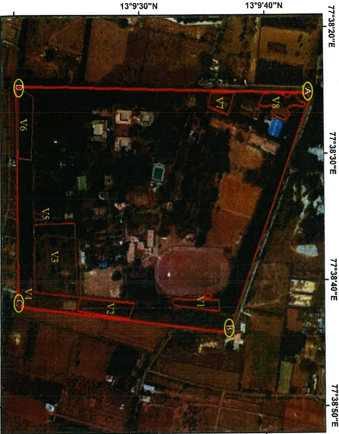
Boundary Area coordinates for Compensatory Plantation